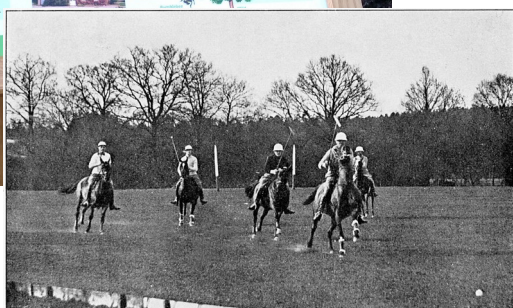
Early Polo on one of the Fleet Grounds. (From a photo taken at the beginning of April).